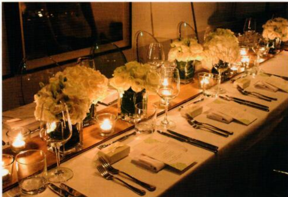
A candlelit table setting by Sweet Soirees.

two hours to ensure they make it to midnight.